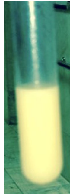
FIGURE 4 Thoracentesis of pleural effusion showed a milky fluid

normal and abdominal sonography revealed one cyst with 59 mm diameter and many wrinkle membranes in pleural space (Figure 3). Thoracentesis obtained a milky fluid (Figure 4) with the following biochemical values: 4800 leukocytes/mm 3 with polymorphonuclear predominancy leukocytes/mm 3 ; total protein 10.8 g/dL; lactate dehydrogenase (LDH) 5744 U/L; glucose