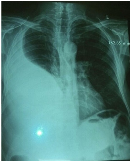
FIGURE 1 AP view of CXR showed pleural effusion